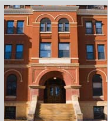
Former St. Columba Grade School