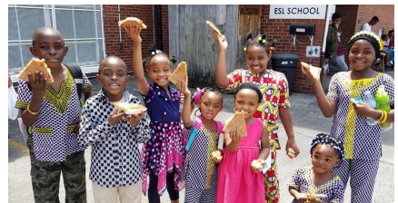
Pizza Party! These kiddos shared a slice at our St. Anthony Campus

The Sister Visitor Center serves the residents of Louisville's West End, and assisted 8,376 individuals seeking emergency assistance for rent, utilities, food, clothing, prescriptions and household items this year.