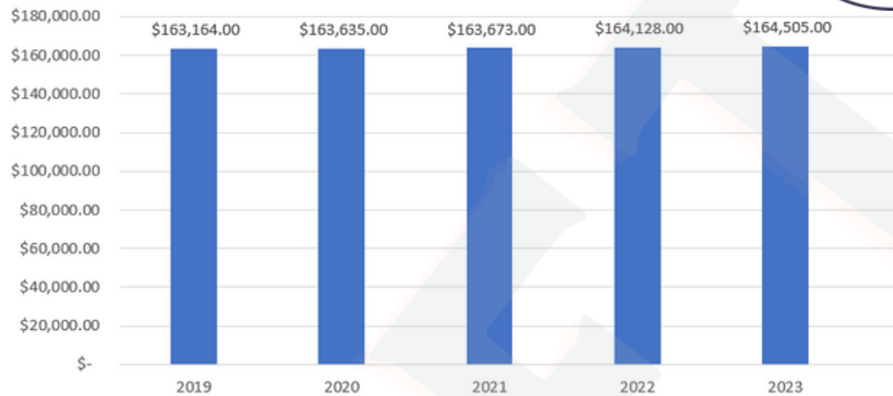
State General Funds Allocations